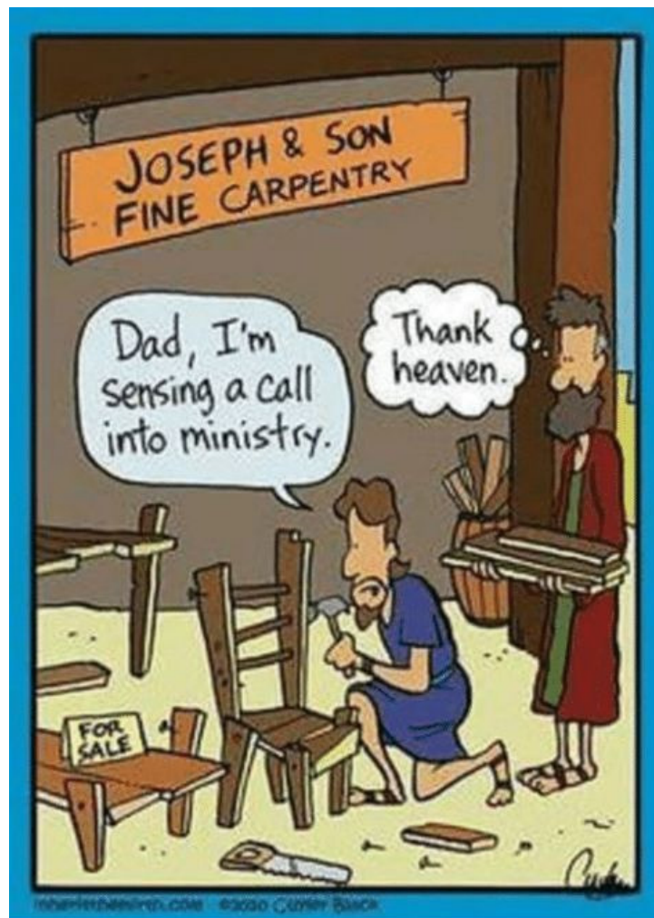
A little Father's Day humor (Cartoon by Inherit the Mirth)